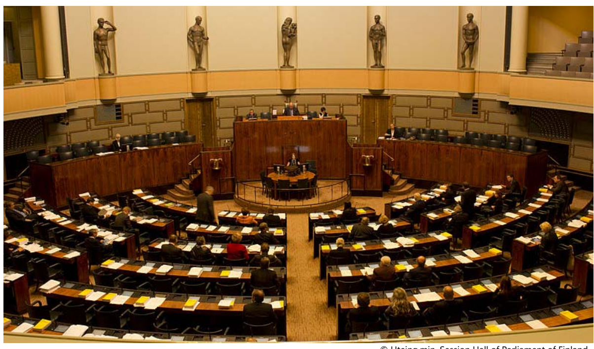
© Hteing.min, Session Hall of Parliament of Finland