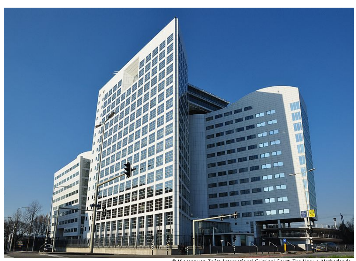
© Vincent van Zeijst, International Criminal Court, The Hague, Netherlands