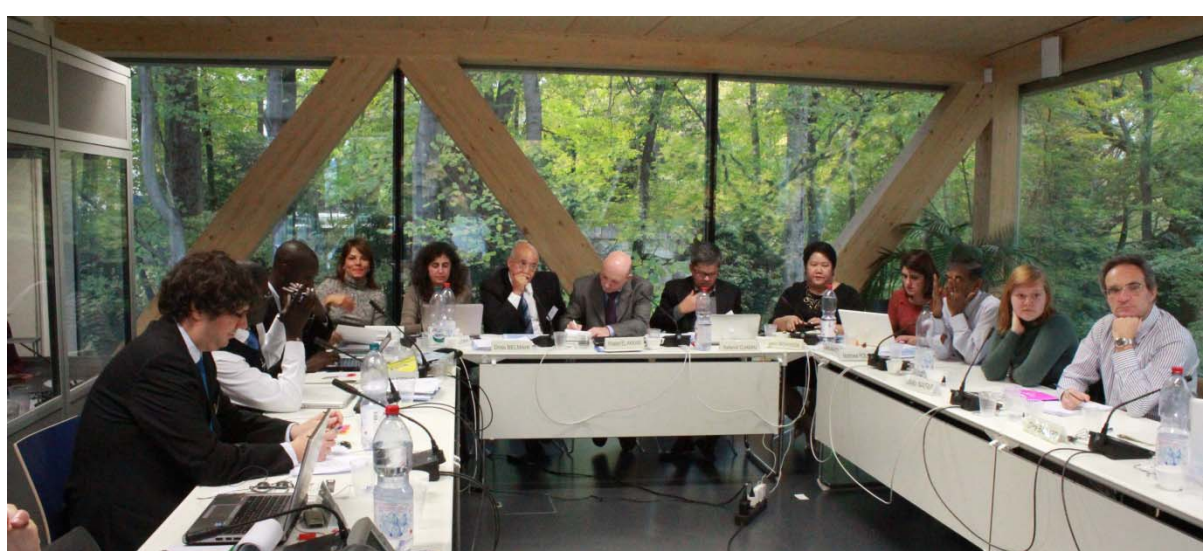
during the Expert Meeting at Centre Jean-Jacques Gautier in Geneva