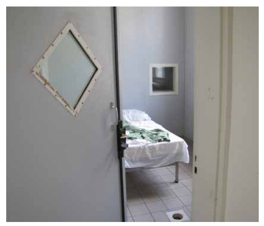
Isolation room in a psychiatric hospital