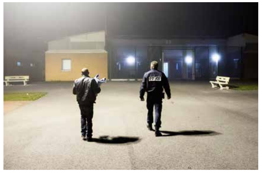
Arrival of a person in a detention centre for undocumented migrants

13/ The centre must expect and plan for receiving families. Currently, detainees' families can wait several hours, sat on the floor or on the ground, covered with the dust created by every vehicle that enters the centre. Benches and parasols should be made available, and a wall constructed as protection against splatter from the road.