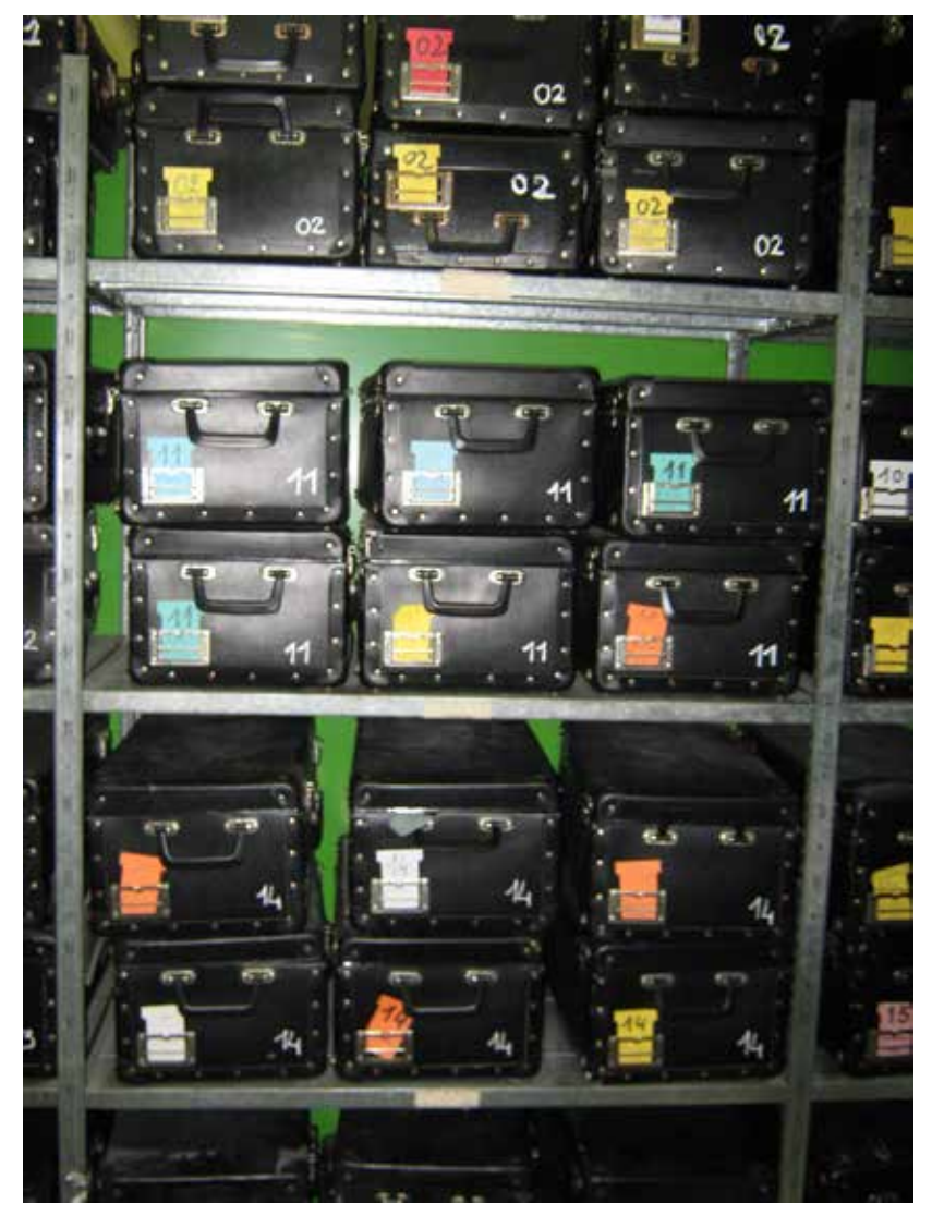
Room called vestiaire where personal belongings of detained persons are stored