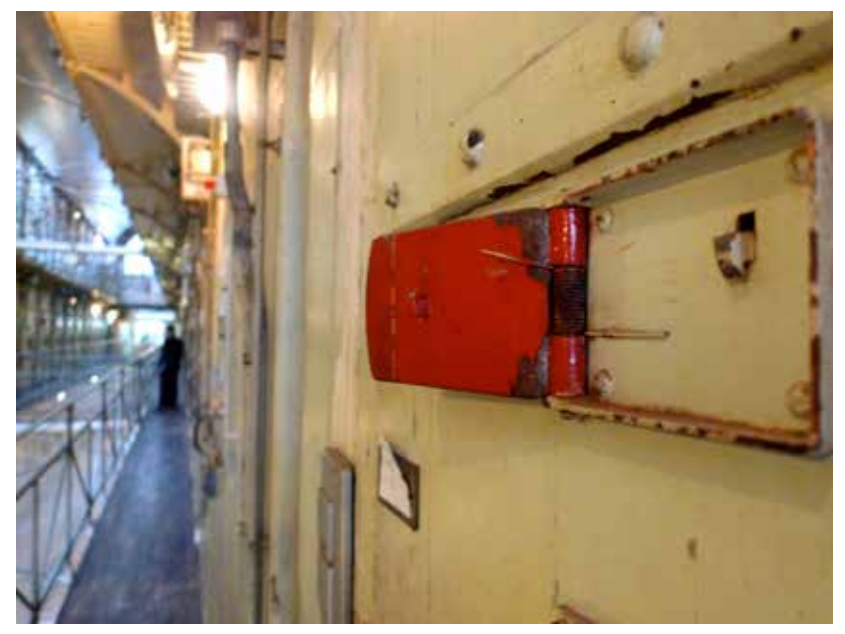
Corridor of a remand prison