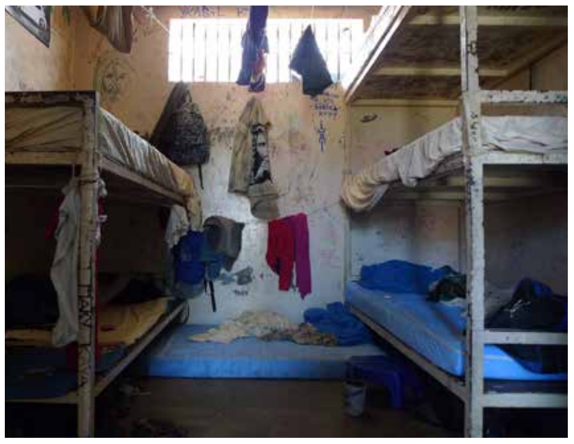
Shared cell in a remand prison of an overseas territory of France

6/ The automatic processing of certain procedures (expulsion, parole) is clearly driven by the need to regulate the occupancy rates in the areas concerned. It would appear necessary to return to an individual approach in dealing with situations.