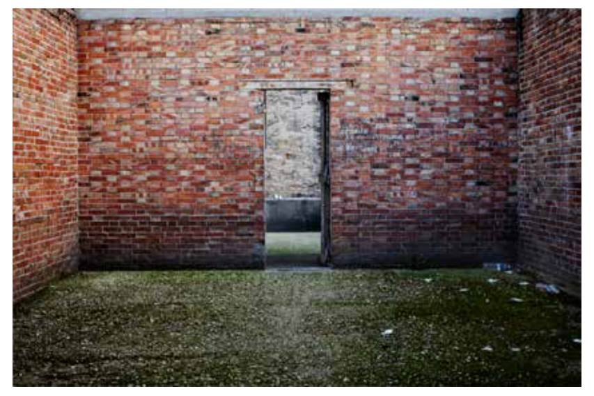
Passage in a detention centre

The texts compiled in this publication were translated into English by different translators at different points in time between 2008 and 2014. An effort has been made to harmonise certain differences between American and British spelling (in favour of the latter) and some technical vocabulary. However, some variations originating from different writing styles cannot be excluded.