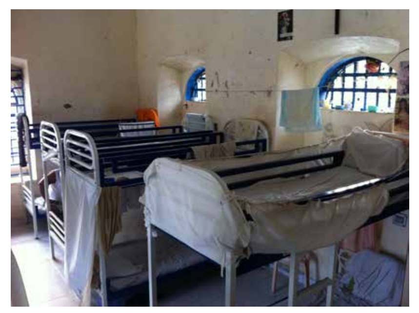
Shared cell in a remand prison of an overseas territory of France

9/ In the current circumstances, the Contrôleur général is obliged to conclude that the stated violations have not ceased.