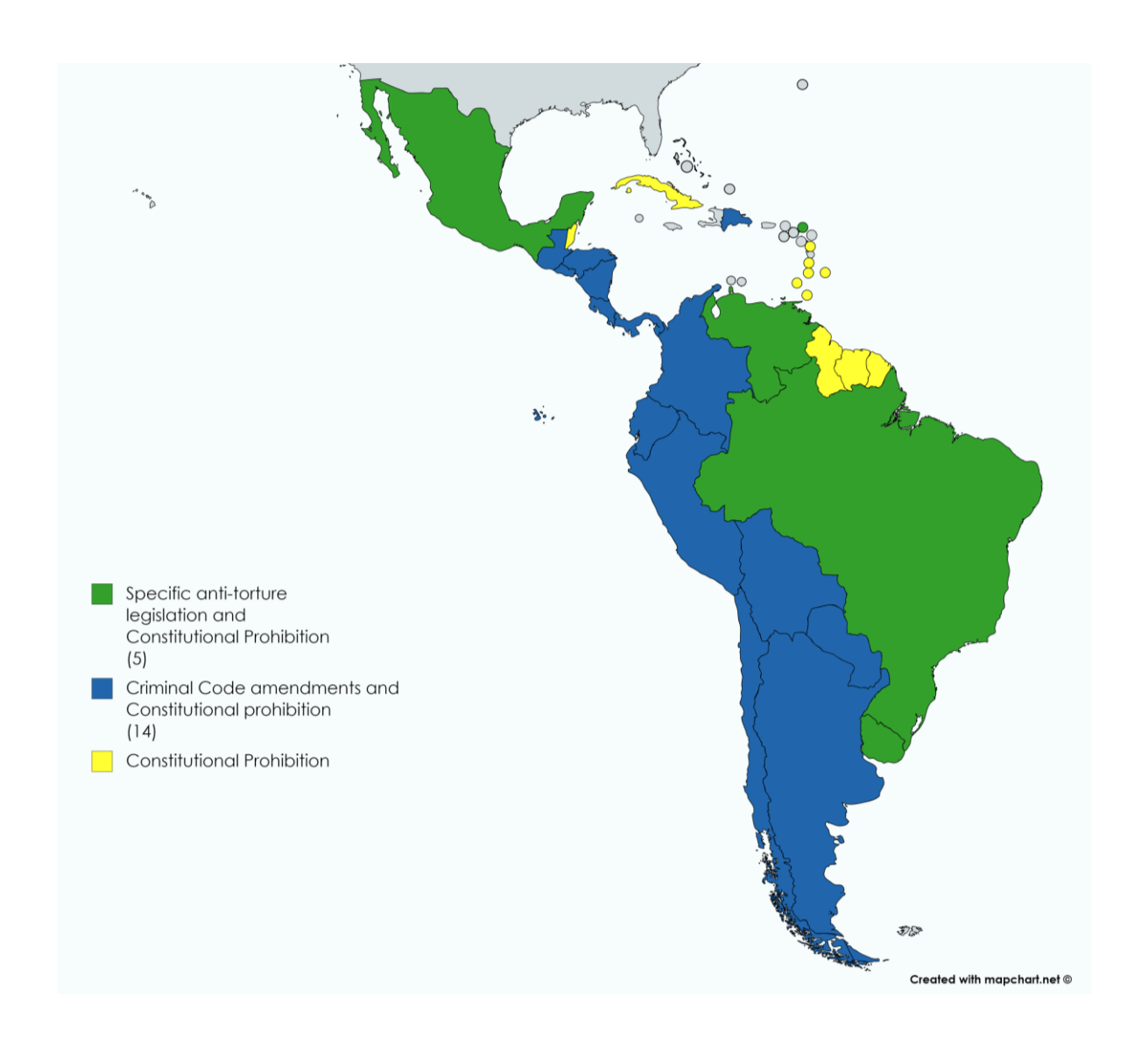
Figure 1. Overview of the national approaches regarding the prohibition of torture